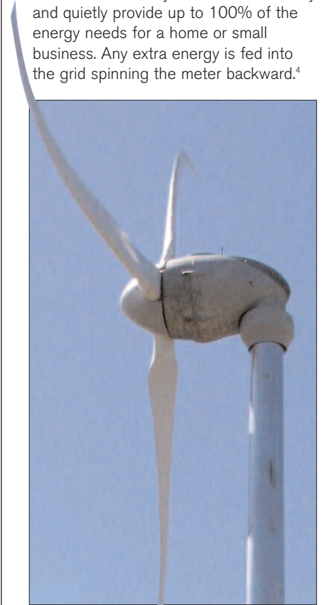
UL Certification and CE Certification Pending

Skystream is available on towers ranging from 35' (10.67m) to 110' (33.5m). 2 Its universal inverter will deliver power compatible with any utility grid from 110-240 VAC. 3 Skystream will efficiently and quietly provide up to 100% of the energy needs for a home or small business. Any extra energy is fed into the grid spinning the meter backward. 4